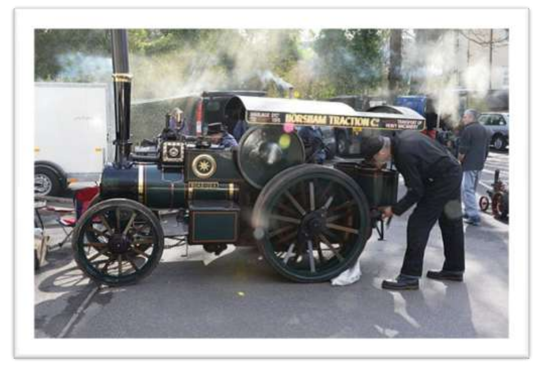
I'll show that b***** in front

Here are a couple of my favourite shots: