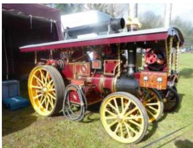
Photo 2 - The Lady of the Lake – 4” Burrell Scenic Showman’s Road Loco. Colin Alexander built this engine in 3.5 years from parts supplied by Steam Traction World and the model was finished in 2013.