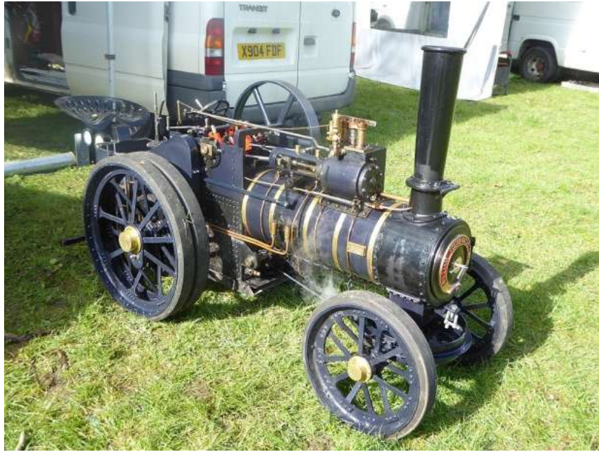
Photo 8 – 4” Foster traction engine owned by Derek Edwards, built 1991 and reboilered in 2014.