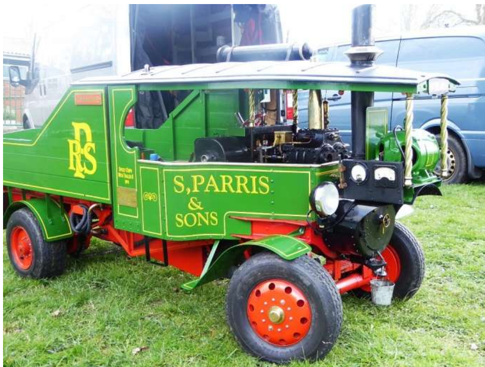
Photo 13 – 4 ½" Foden Steam Wagon owned and built by Steve Parris and finished 2012.