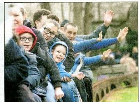
A big wave as a steam engine goes by