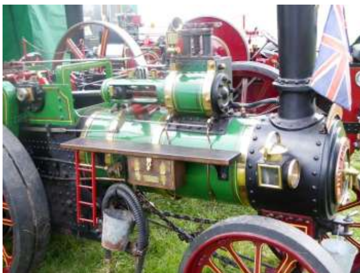
Photo 3 – 4” Foster Agricultural Traction Engine built and owned by Terry and Andrew Wildish and finished in 2004.