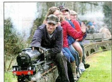
Passengers enjoying a ride at the steam gala