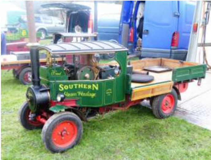
Photo 14 – 4 ½” Foden Compound Steam Wagon built and owned by Rod Southern and finished in 2000.