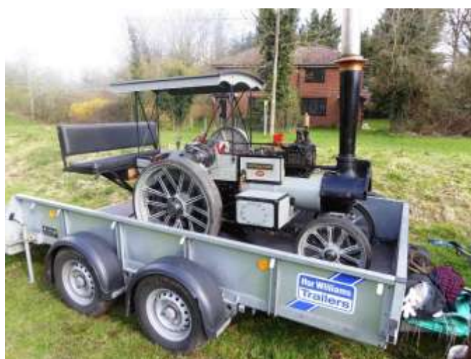
Photo 4 – 6” Burrell Gold Medal Tractor by A B Attwell. This engine took 5 years to build and was finished in 2015. Mr. Attwell is in the process of building the convertible front fork and front and rear rolls.