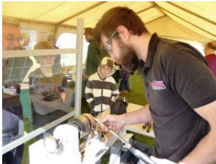
Photo 15 – Basingstoke’s Axminster Tools not only supported the event but as shown in this picture, provided a very skilful demonstration of turning a wooden bowl.