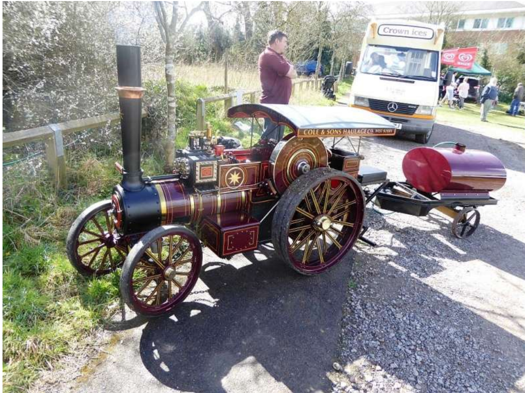
Photo 10 – 4” Burrell DCC Road Loco and the very popular ice cream van in the background.