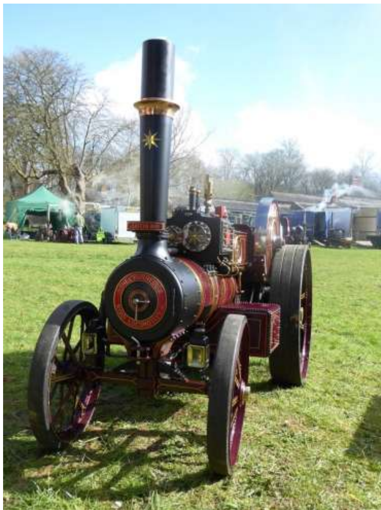
Photo 9 – 4” Burrell DCC Road Loco owned and built by Andrew Cole. It was started in 2011 and completed in 2013 using parts supplied by Steam Traction World.