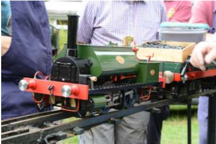
Photo 17 – Barry Spender’s 5”gauge Gemma being admired in the steaming bay at the Basingstoke track.