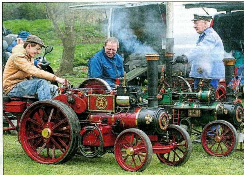
Full steam ahead at the annual Basingstoke & District Model Engineering Society Steam Gala