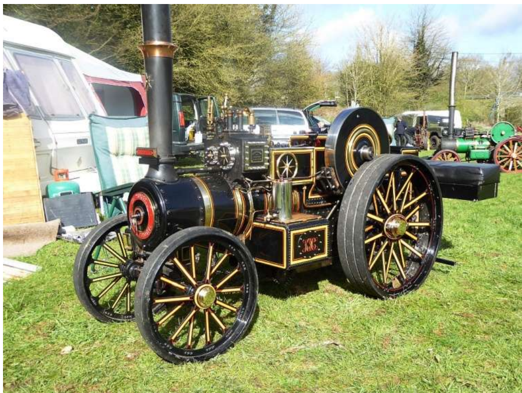
Photo 11 – 4” Burrell DCC Road Loco built and owned by Kevyn and Naomi Chambers with parts supplied by Steam Traction World. It was the first engine of this design to be in steam and was completed in 2012 after a three year build.